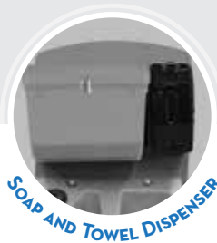
SOAP AND TOWEL DISPENSER