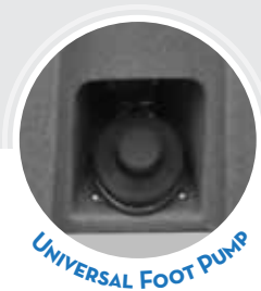
UNIVERSAL FOOT PUMP