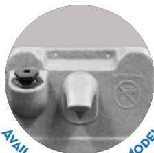
AVAILABLE IN A SLIM MODEL