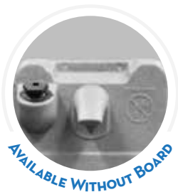
AVAILABLE WITHOUT BOARD