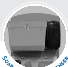
SOAP AND TOWEL DISPENSER

SPECIFICATIONS HEIGHT WITHOUT BOARD - 45" HEIGHT W/BOARD - 64" WIDTH - 19" DEPTH - 10.5" COLOR - GRAY WEIGHT EMPTY - 17 LBS TANK VOLUME - 12 GAL