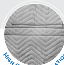
HIGH QUALITY INSULATION