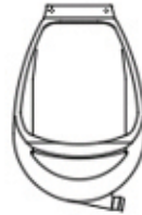
11999 URINAL, SPLASHGUARD DGRY 1987 TO PRESENT