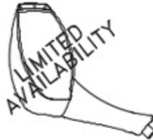
16794 URINAL, MX3 DGRY 2000 TO 2016