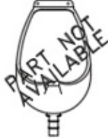
16155 URINAL, VERTICAL DRAIN WHT 1998 TO 2004