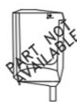
13958 URINAL, QV2 1991 TO 2001