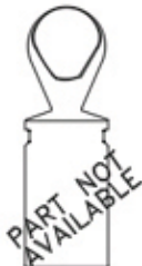
11337 URINAL, HI-RISE 1980 TO 1999