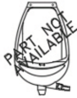
14098 URINAL, TRIAD MOUNT 1991 TO 1993