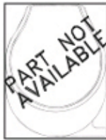
10593 URINAL, 1975 TO 1982