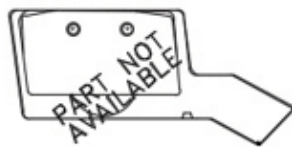
16701 URINAL, TROUGH 2002 TO 2012