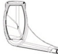
22193 URINAL, MAXIM 3000 II DGRY 2016 TO PRESENT