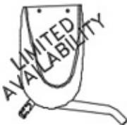
40162 URINAL, GLOBAL 2006 TO 2016 (NOT AVAILABLE AS A REPLACEMENT PART) (USE #21636 KIT, GB URINAL SPLSHGUARD DGRY)