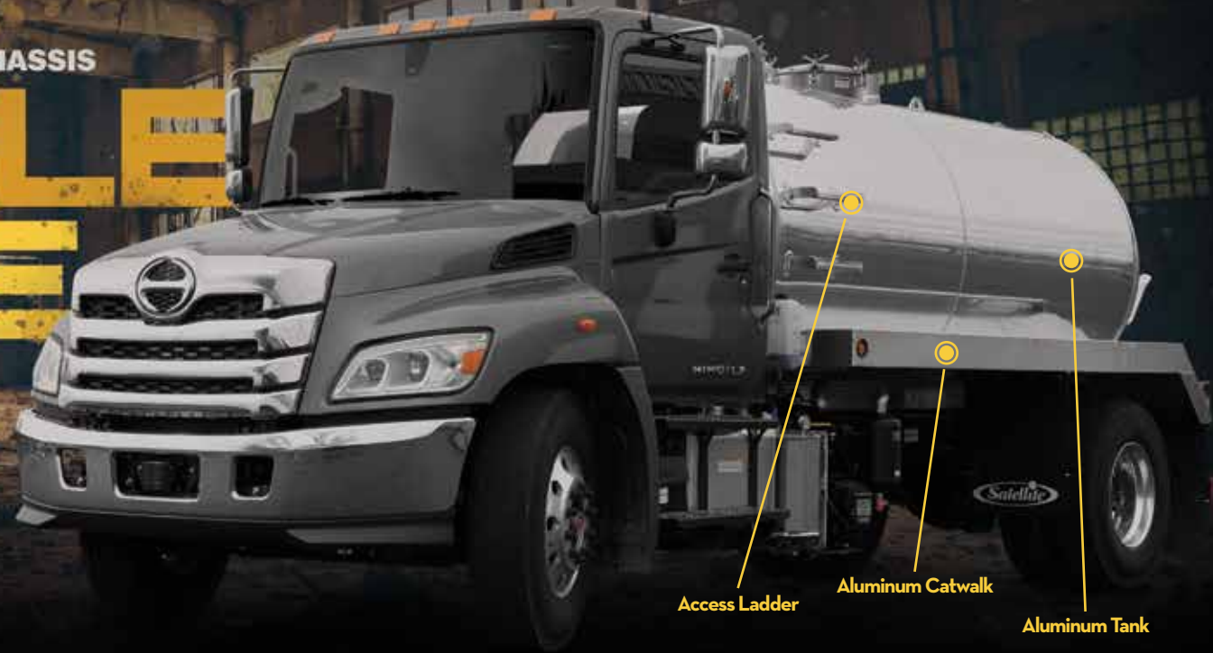
Access Ladder Aluminum Catwalk Aluminum Tank