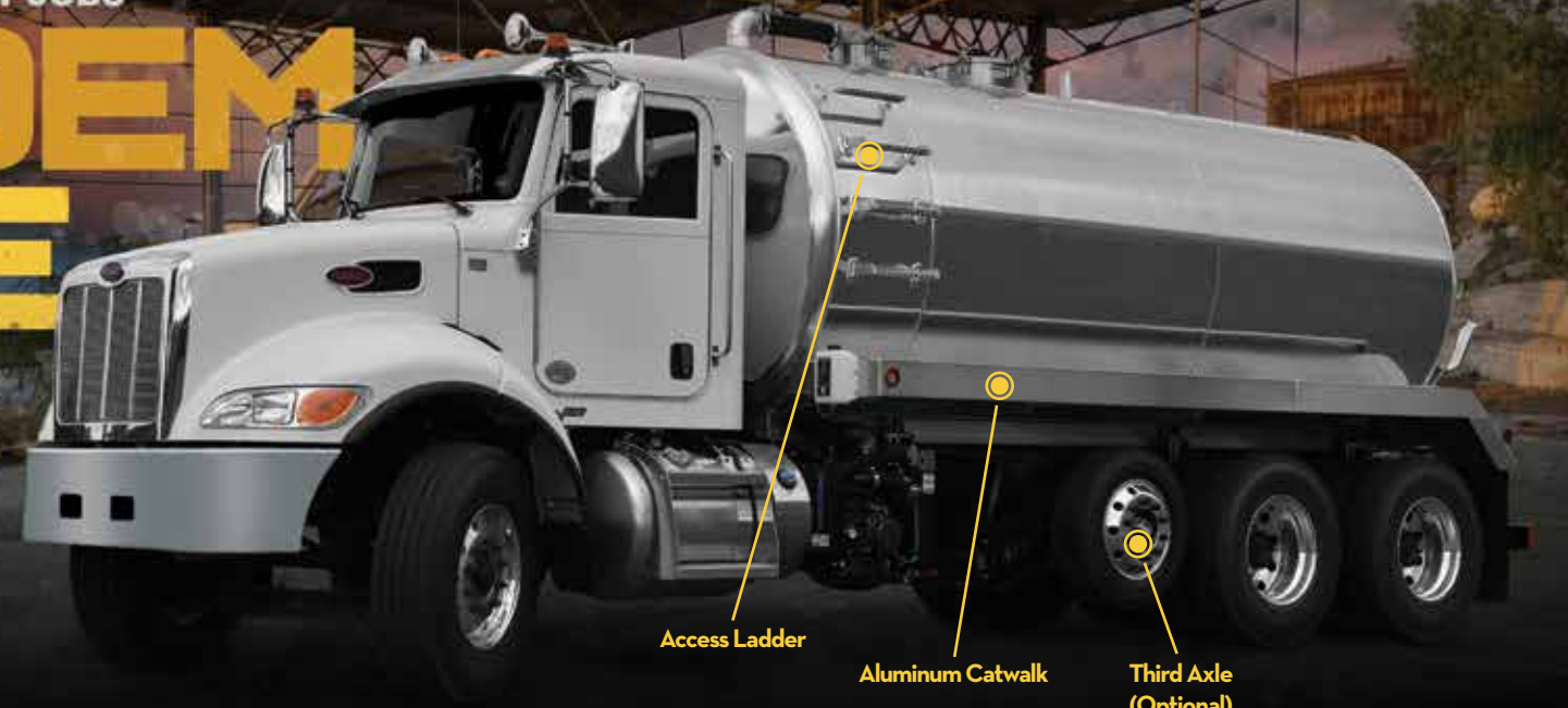
Access Ladder Aluminum Catwalk Third Axle (Optional)