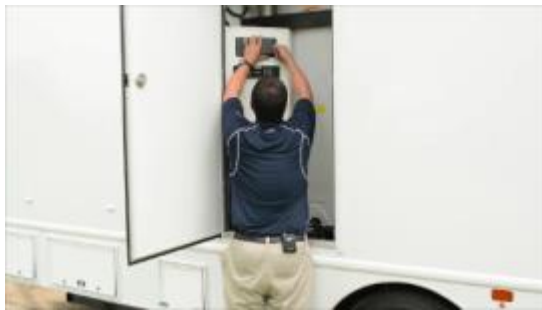
Removing Fuse Panel