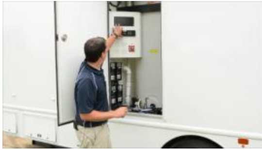
12 Volt Panel - Converter