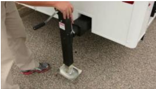
2. Insert Keeper Pin.