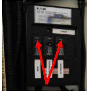
Women's AC Breaker

Turn on air conditioning at the control panel on the AC unit to cool. The setting must be colder than the inside temperature to operate. The AC/Heating Unit has retractable air vents, easy to use controls and pop off vent screen for easy cleaning.