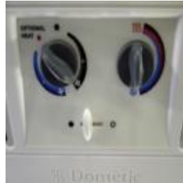
Turn On Controls