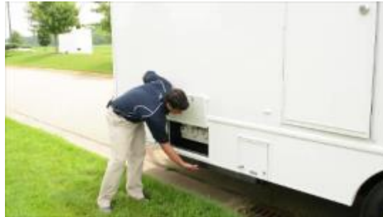
2. Easy to Use Drop Down Access.