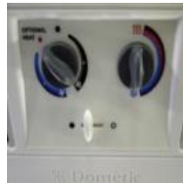
Turn On Controls