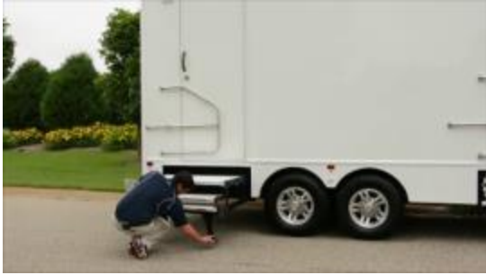
5. Pull Down Right Front Stair Jack.