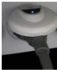
Check Blue Light on Trailer