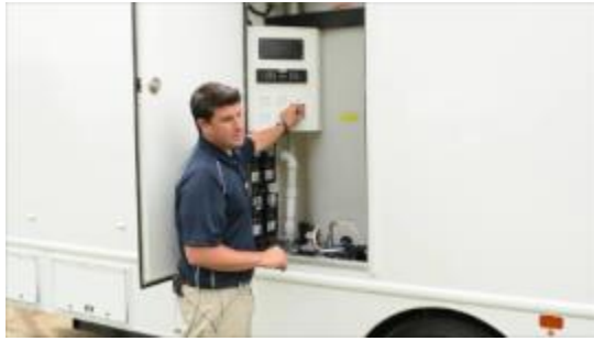
Battery Disconnect in unit