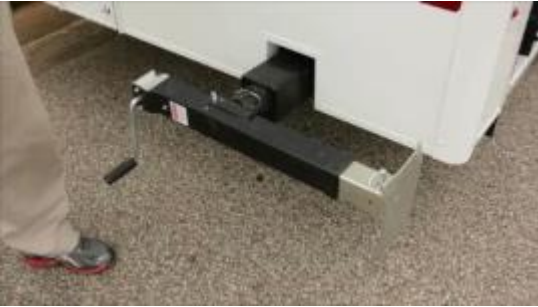
Sidewinder Leveling Jack

The Satellite Suites™ 20 foot trailer has two side-winder jacks located in the front and back of the unit. We recommend the following step by step instructions before operating the trailer.