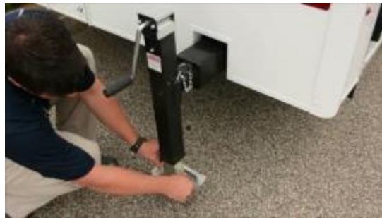
3. Remove Quick Adjust Pin.