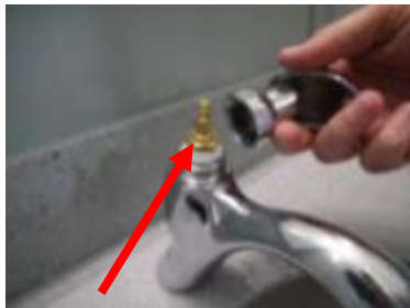
3. Remove Cartridge