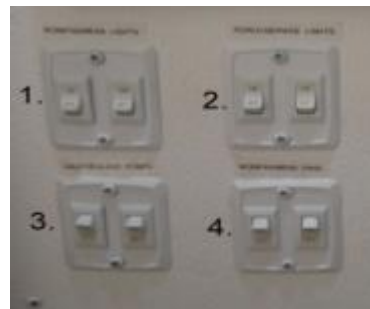
12 Volt Switches in Unit