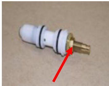
4. Adjust Cartridge by Loosening Hex Nut.

Adjust the cartridge counter-clockwise to increase and clockwise to reduce water flow. Be sure to reverse your steps and reinstall the cartridge.