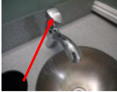
1. Remove Chrome Nut

If water continues to run too long or short, the faucet cartridge can be adjusted for more or less water flow. Always shut the water off before adjusting the faucet.