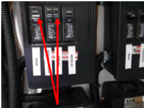
Turn on AC & Service Area Breakers