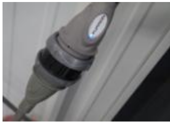
Check Blue Light on Cord

THE CORD IS 30 AMP TWIST-LOCK STYLE, BUT WILL NOT DRAW MORE THAN 20 AMPS.