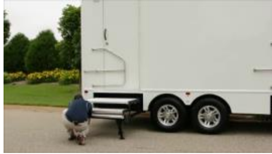
6. Pull Down Left Front Stair Jack.