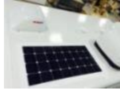
Solar Panel (Roof)