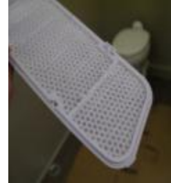
Clean Vent Screen & Filter

To operate the heating unit the proper circuit breakers must be plugged in and on.