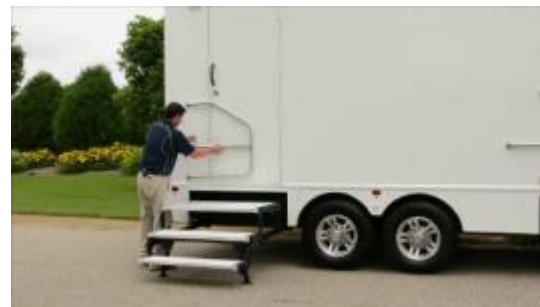
11. Remove Door Handle Pin.