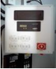
12 Volt Converter Switches