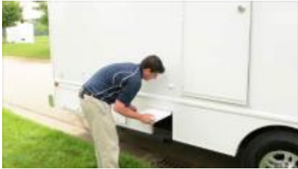
Water Connection Port.

To operate the system after trailer is leveled and stairs deployed, connect a 3/4" garden hose to the trailer's water connection. The trailer comes standard with a pressure regulator that cuts pressure to approximately 40 psi. If no continuous water condition is available the system can be operated by using the on-board fresh water tank.