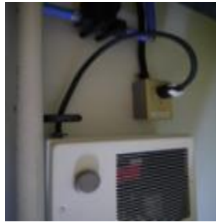
Optional Service Area Heater

Optional forced air heat is located beneath the vanity. The main breaker and appropriate (men's/women's) switch must be in the on position. Use the forced air heat when the outside temperature is below 50 ° Fahrenheit.