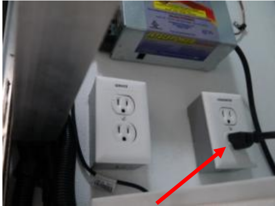
Disconnect from Converter

Move the Converter plug from the converter receptacle to the service receptacle.