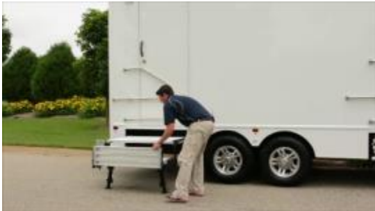
9. Fold Down Bottom Step.