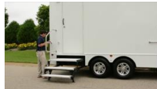
12. Install Door Handle Pin.

Note: You can also add tension to the step jacks by placing your foot on the jack front while pulling up slightly on the side of the steps.