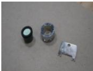
Disassembled Aerator and Key

Adjust the cartridge counter-clockwise to increase and clockwise to reduce water flow. Be sure to reverse your steps and reinstall the cartridge.