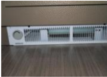
Forced Air Control