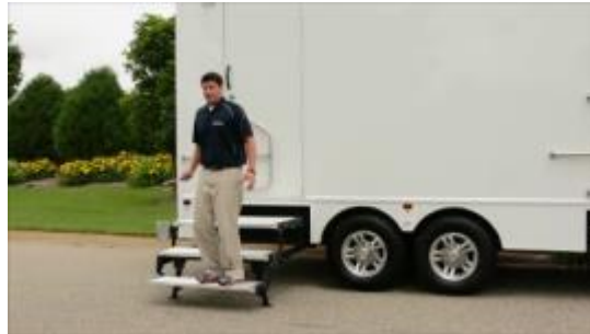
10. Apply pressure to secure stairs.