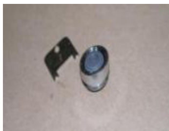
Cleaned Aerator Assembled