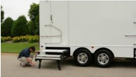
7. Add Tension with Service Area Bar.