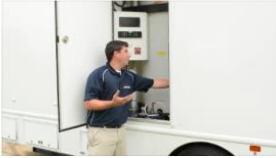
Water Filter in Unit.