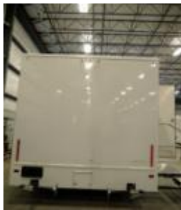
Rear of Trailer.