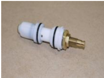
3. Remove Cartridge