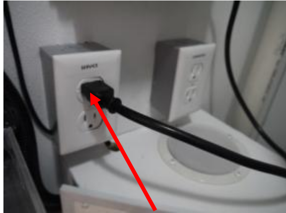
Connect into Service Area Outlet.