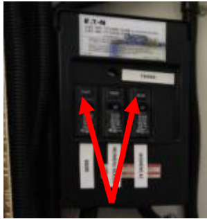
Men's AC Breaker

To operate the air conditioning unit, the main breaker, 20 amp AC breaker must be plugged in to a live power source and turned on. The main breaker must always be in the on position.