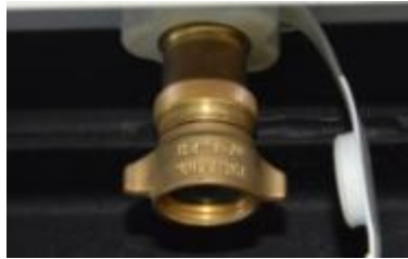
3/4" Water Connection

Note: It is recommended to use 40-60 psi during operation. If the water pressure is above the recommended 40-60 psi your unit can overpower your fixtures inside the trailer. Golf Courses or municipal water systems normally have higher pressure. (100 psi.)