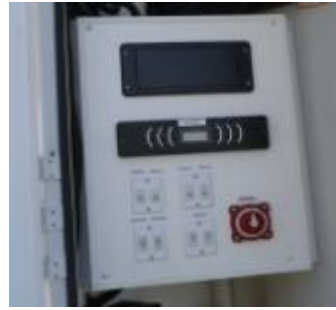
12 Volt Panel