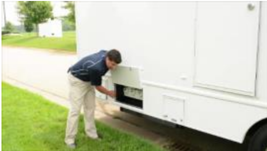
1. Electrical Outlets

The Satellite Suites™ 20 foot restroom trailer has two to four easy to use electrical outlets. We suggest running all electrical cords after connecting thru the easy to use drop down access port.