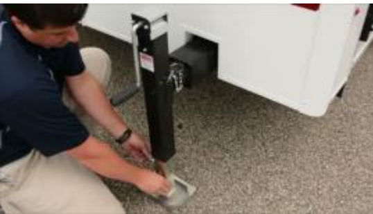
4. Adjust Height and Insert Pin.