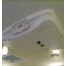
Open Air Vents