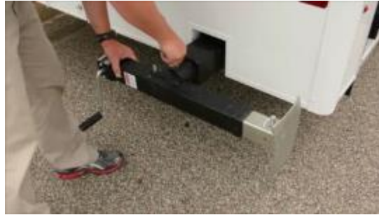
1. Remove Keeper Pin then rotate 90°