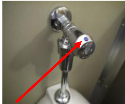
2. Remove Cap and Screw with Allen Wrench.