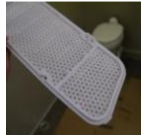
Clean Vent Screen

Note: Clean the AC unit filter by removing the access panel on the unit. Clean every six months, more often in dirty conditions. To clean, remove the filter and debris by blowing or washing it off. Replace when done. The heat strip in the AC unit will heat the trailer when the exterior temperature drops to as low as 50° for colder conditions use the optional forced air heaters - if included on your trailer.