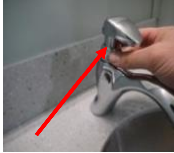
2. Remove Fastener