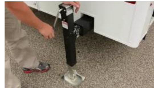
5. Once in contact with the ground rotate three to five times.