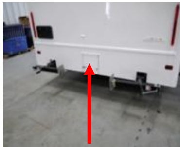
Accessible 4" Clean Out Port.

The Satellite Suites™ 20 foot trailer has an easy to use 4" clean out port for your waste tank. We use a smooth polypropylene tank so waste won't stick to it, and added a low point sump with bottom dump so you get all the waste out when the unit is pumped. We suggested using a power washer to clean out the tank occasionally.