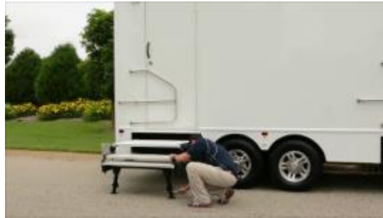
8. Add Tension with Service Area Bar.