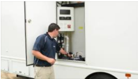
Pressure Gauge in Unit.