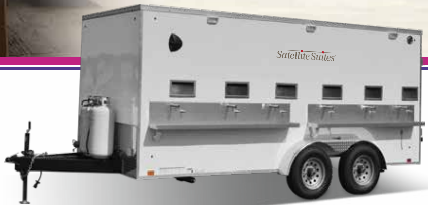
Shown: 16' | 12 Station | Sink Suite

Looking for an innovative solution to the growing demand for handwash units? Look no further! The Satellite Suites Sink Suite will serve groups of all sizes with an open, functional design and large water capacity to meet your customers' needs without infringing on your drivers daily routine. The 16' reinforced chassis allows it to be trailered with a full fresh OR graywater tank, making it easy to set-up and take-down. Bulk soap and paper towel dispensers along with push button metered faucets assure full days of service.