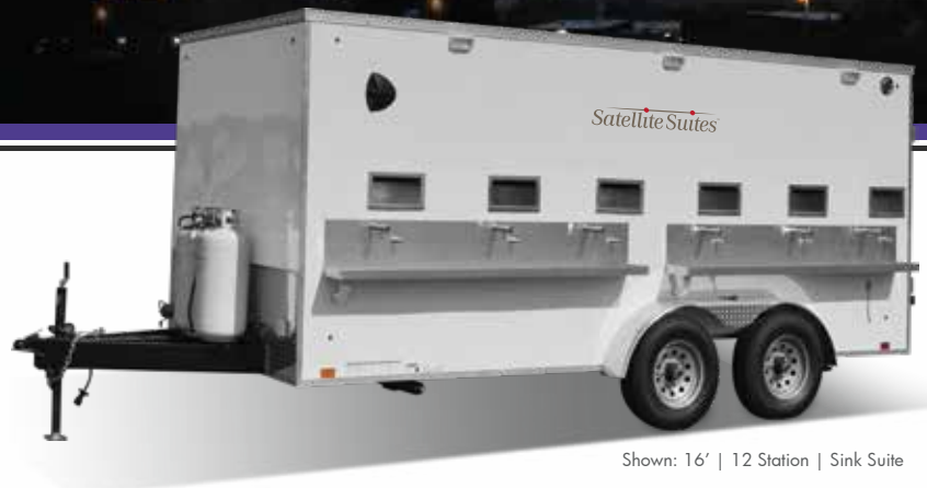
Shown: 16' | 12 Station | Sink Suite

Looking for an innovative solution to the growing demand for handwash units? Look no further! The Satellite Suites Sink Suite will serve groups of all sizes with an open, functional design and large water capacity to meet your customers' needs without infringing on your drivers daily routine. The 16' reinforced chassis allows it to be trailered with a full fresh OR graywater tank, making it easy to set-up and take-down. Bulk soap and paper towel dispensers along with push button metered faucets assure full days of service.